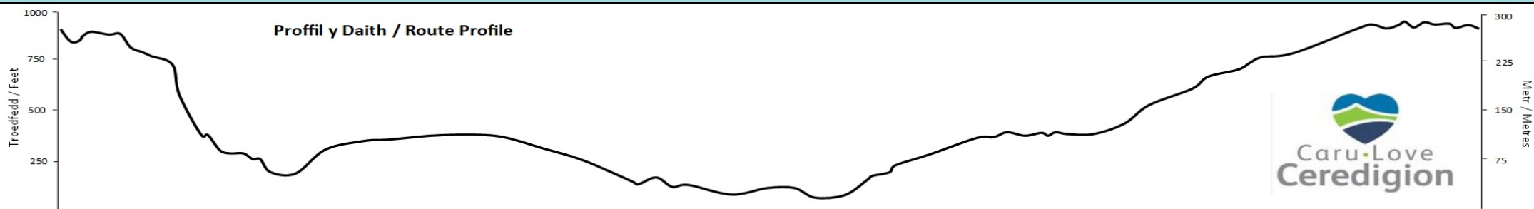
Proffil y Daith / Route Profile

Gellir adrodd unrhyw broblemau y dewch ar eu traws ar Llwybrau Tramwy trwy dudalen "Adrodd Problemau" y Cyngor ar www.ceredigion.gov.uk Any problems encountered on Rights of Way can be logged on the County Council's "Problem Reporting page" at www.ceredigion.gov.uk